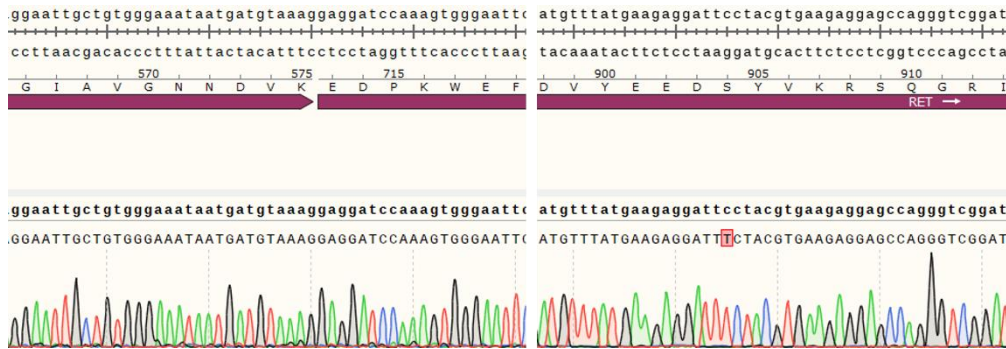
Figure 2 | The KIF5B-RET mutation analysis by Sanger sequencing.